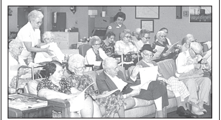
Time and people change, but the Love is still the same! Celebrating 50 years of service!

vices will be available at the center from 11 a.m. to 3 p.m. on Thursday, Feb. 22. Anyone interested in participating should call (785) 475-2208 for an appointment.