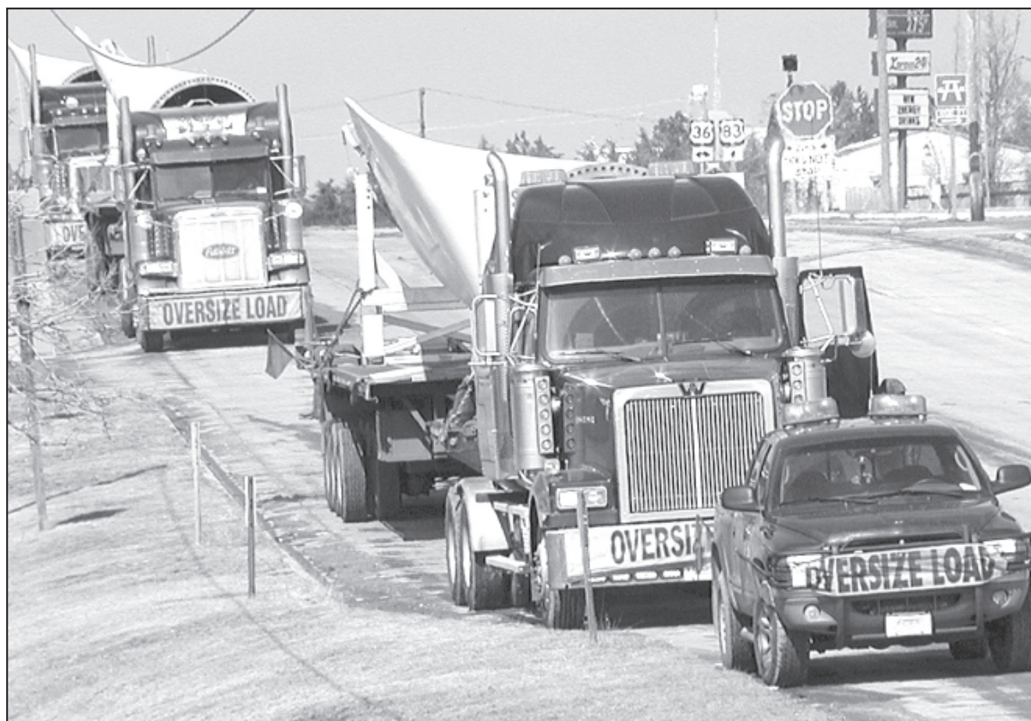
GIANT BLADES for a wind-powered generator headed south on U.S. 83 on Sunday. Each truck was accompanied by signal cars and oversize load signs.