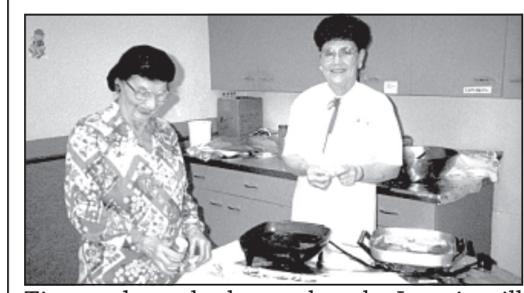
Time and people change, but the Love is still the same! Celebrating 50 years of service!