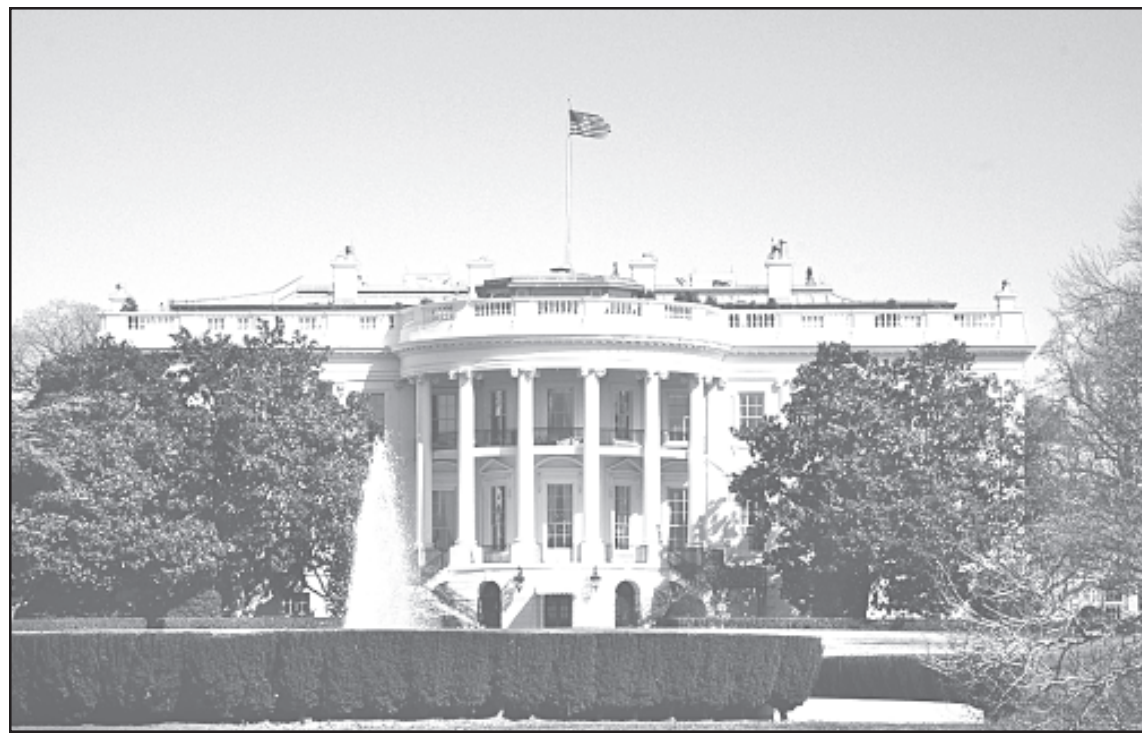
A WHITE HOUSE TOUR was on the agenda for Oberlin seniors visiting Washington.

Tuesday started out by visiting the Udvar-Hazy Space Museum, followed by the National Cathedral, the