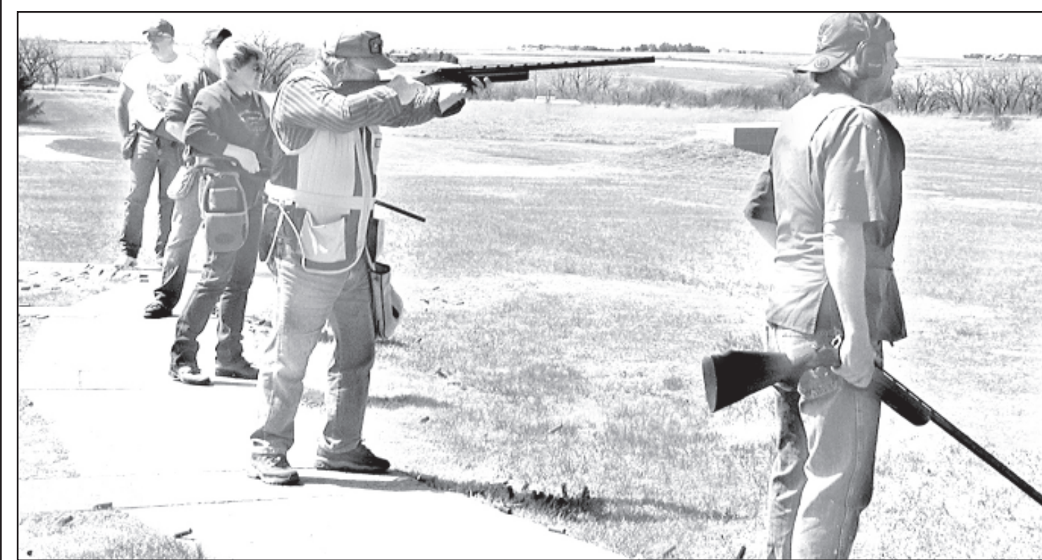
SHOOTERS PRACTICED their skills at the Oberlin Gun Club on Sunday afternoon. Nice weather brought sports fans out to enjoy the day and the weekend.

THE PRAIRIE CHAPEL CHURCH IS HAVING THEIR LORD'S ACRE DINNER AND AUCTION ON SUNDAY, APRIL 22.