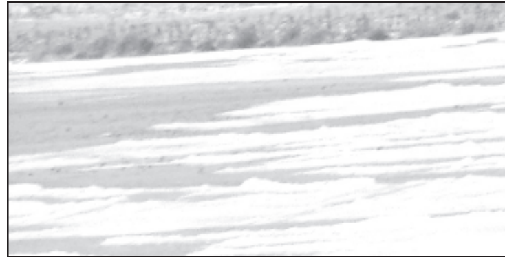
NEARLY AN INCH of hail covered the pavement near Cedar Bluffs on Thursday.