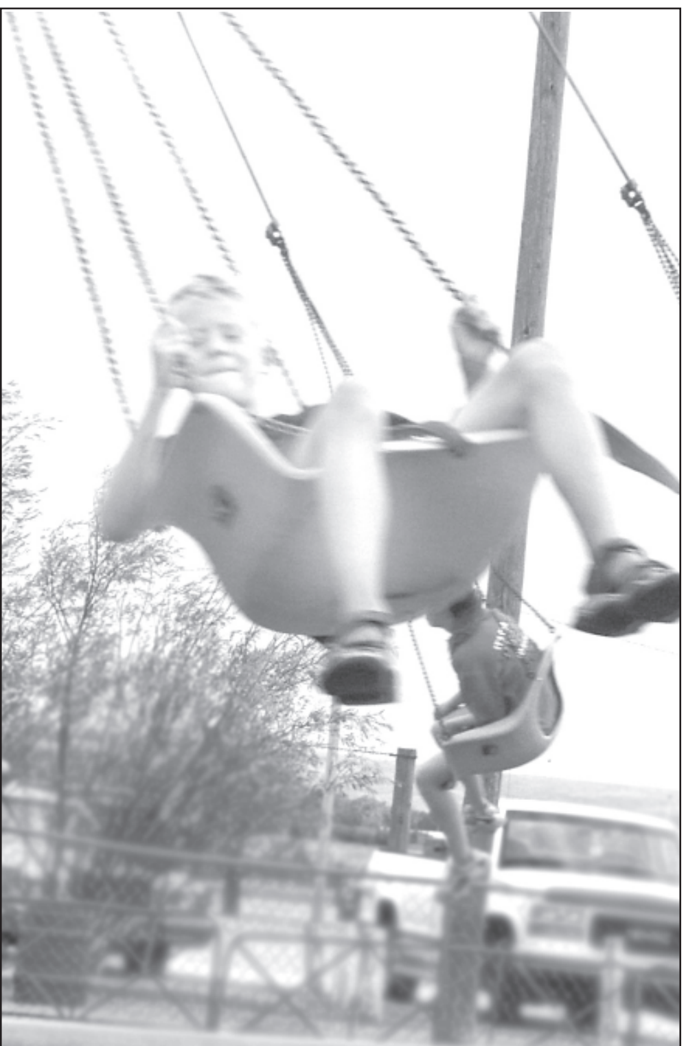
ENJOYING THE SCENERY on the midway as he rode high in the air on an adult swing was a happy fairgoer.