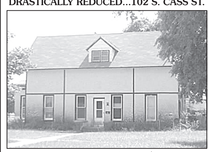
WAS $11,500 NOW ONLY $9,900!

Take advantage of this great opportunity! 3 bedroom, 2 bath, hardwood floors and original woodwork throughout.