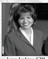
Lynn Jenkins, CPA Kansas State Treasurer

Join State Treasurer Lynn Jenkins, CPA in the Meadowlark Building at the Kansas State Fair to find out if you have any money or property being held by the State Treasurer's office!