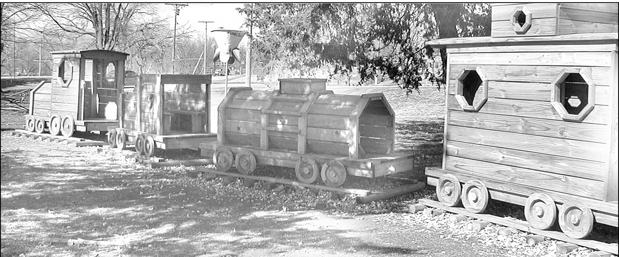
A HANDMADE WOODEN TRAIN entices children and adults to play in the park in Mankato.