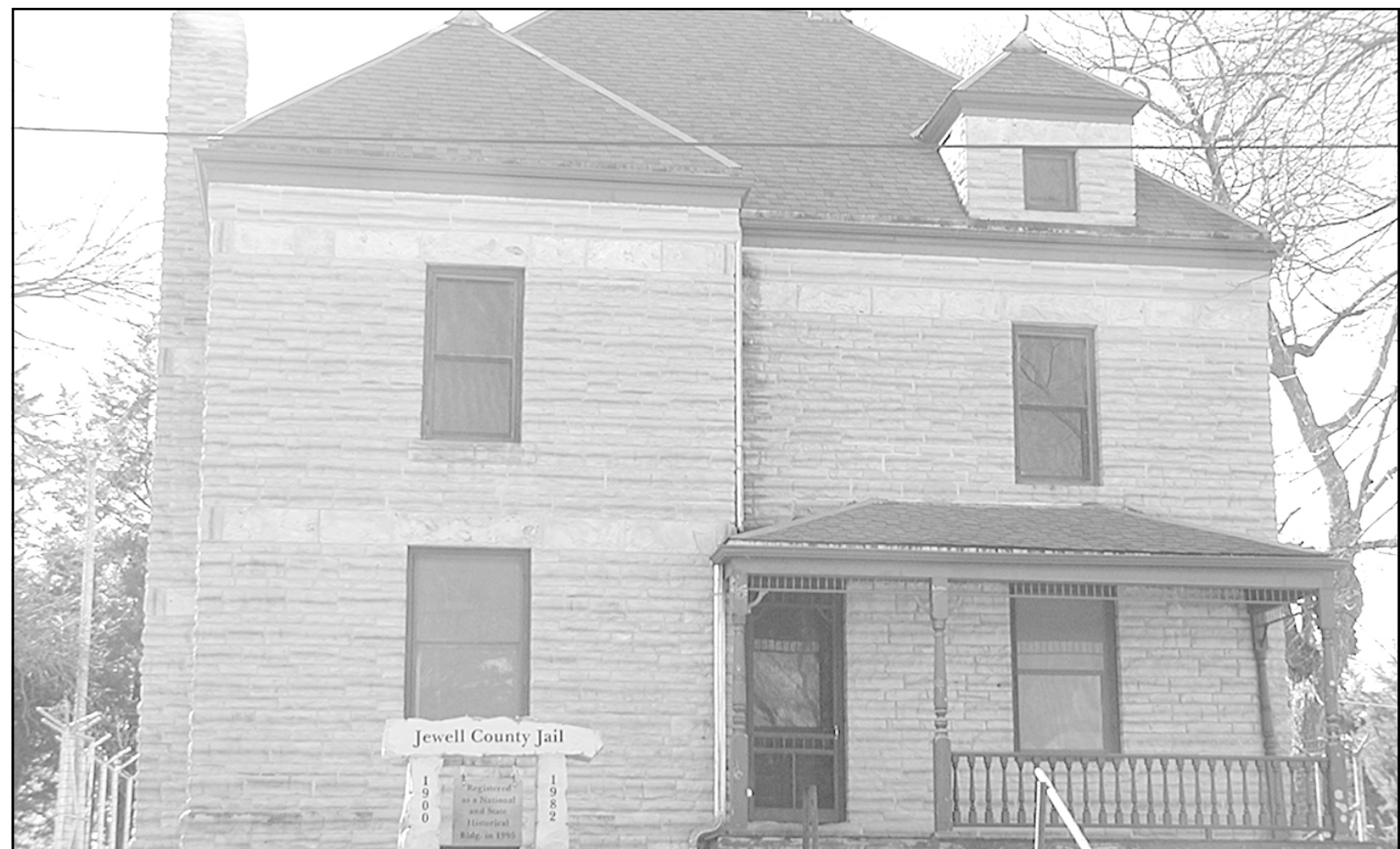
THE OLD STONE JAIL (above) is part of the Jewell County Historical Society Museum. The jail, which is being restored, is on the National Register of Historic Places and the courthouse (below) is made of native stone.

• Jewell County Junior Miss Pageant - April