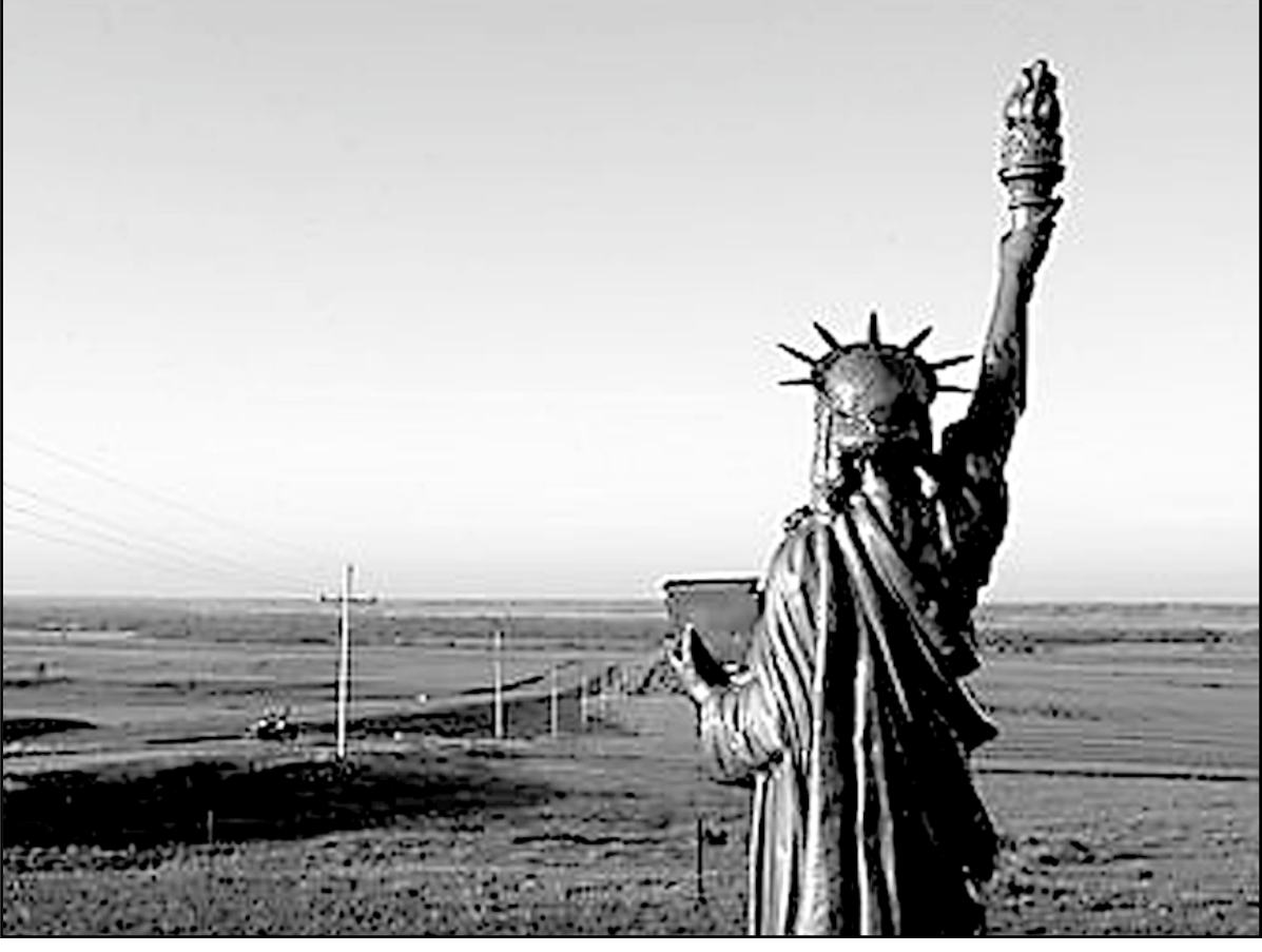
LADY LIBERTY LOOKS OUT over the landscape10 miles south of Smith Center (above) while the cabin, where the song, "Home on the Range" was written, sits on the Beaver Creek.

Smith County offers an array of annual county events. Citywide garage sales are held every first Saturday in June. The Smith County Free Fair is held every July. Every August