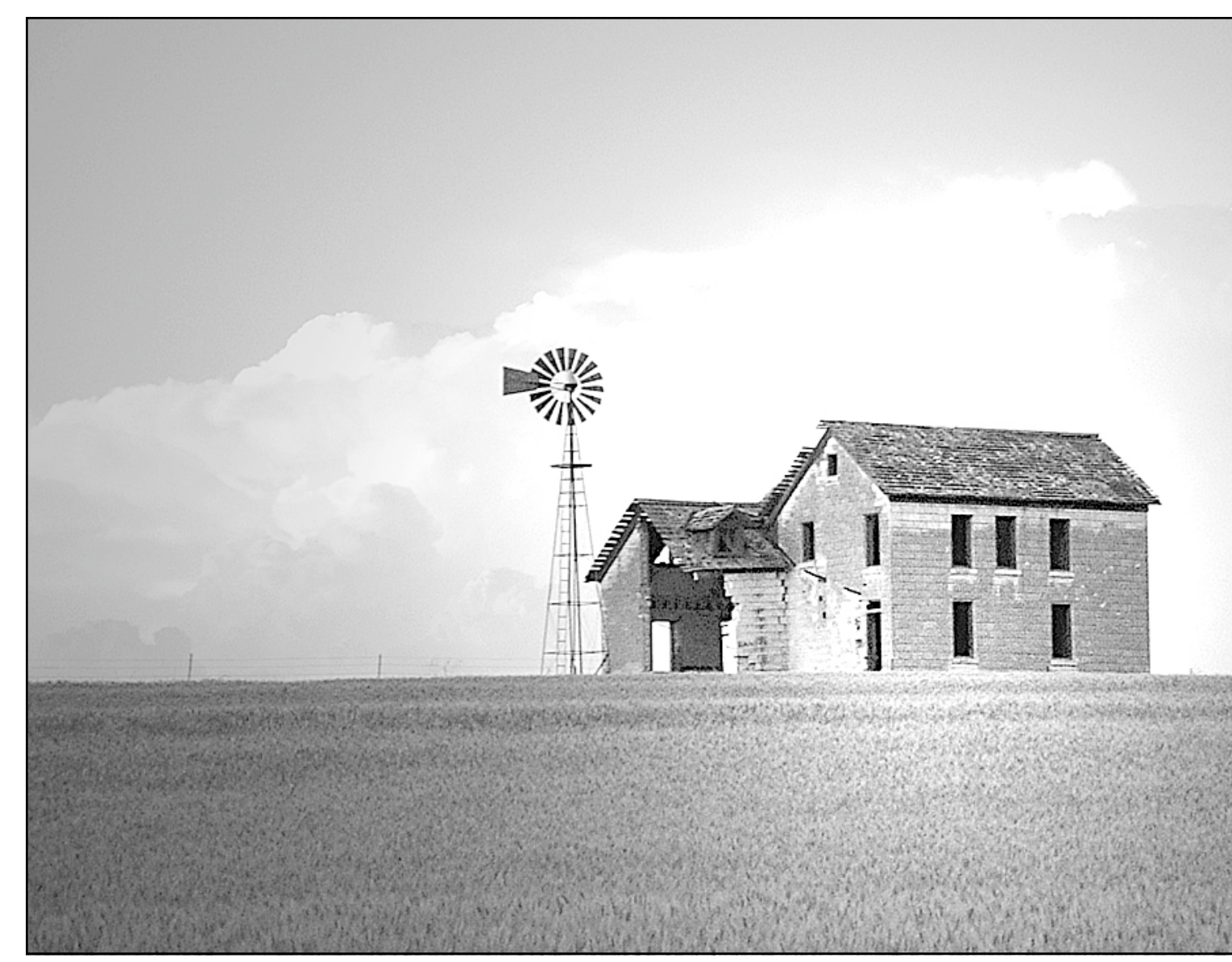
A SENTINAL ON THE PRAIRIE — this old limestone is a popular photo opportunity for travelers along the high-house between Phillipsburg and Stuttgardt along U.S. 36 way.

Both the reservoir and the refuge nestle, lit-