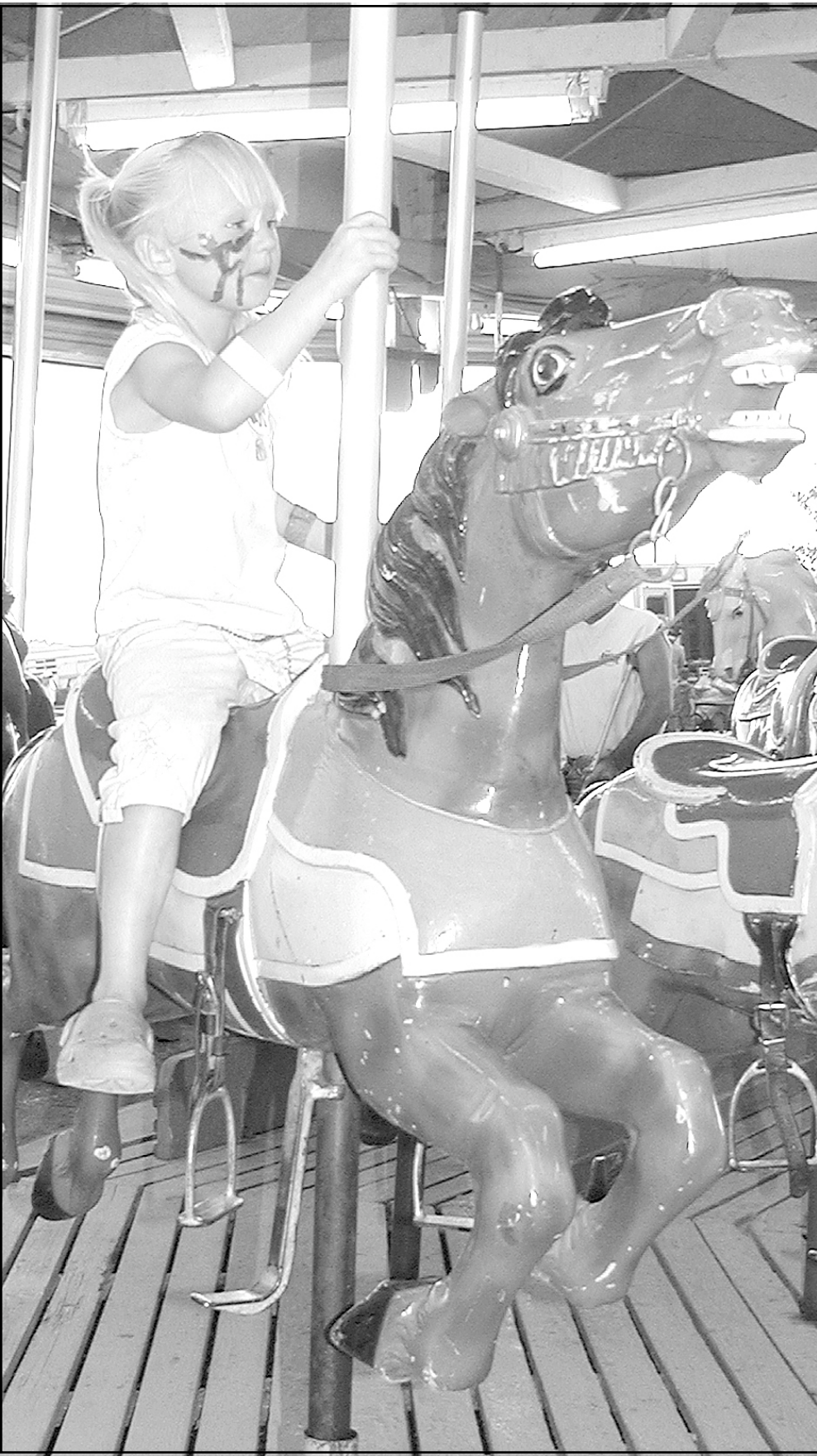
ENJOYING A RIDE ON THE MERRY-GO-ROUND is all part of the fun at the Decatur County Fair and Home-Owned Carnival.