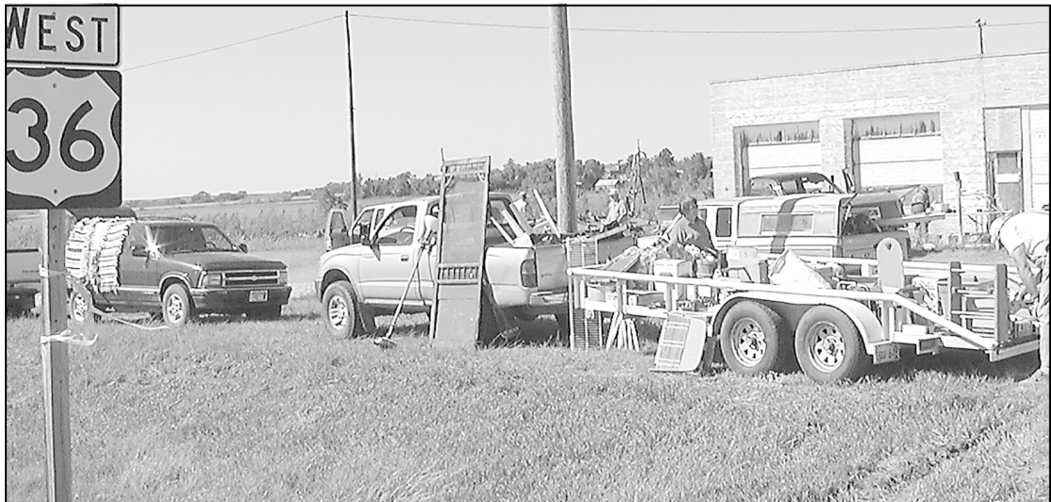
BARGAIN HUNTERS looked for bargains last year during the first U.S. 36 treasure hunt.

While the sale does not officially extend into Colorado several people in the Centennial State have said they would like to put up booths.