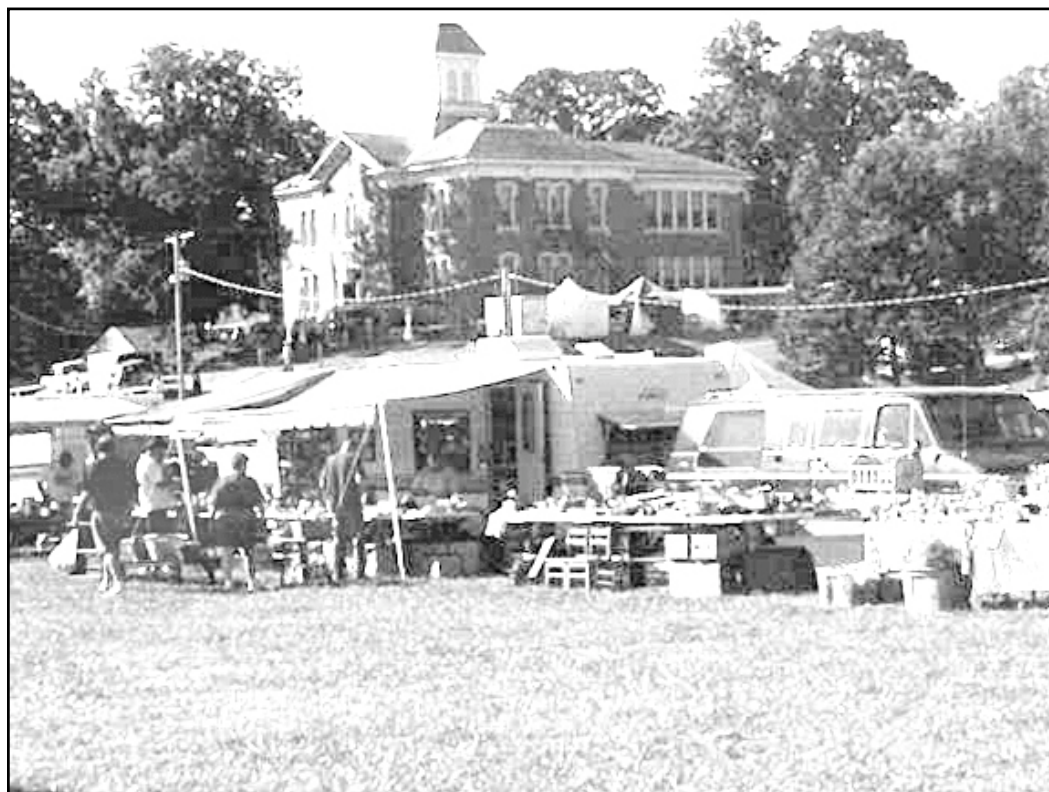
THE WHITE CLOUD FLEA MARKET is a popular spring and fall activity.