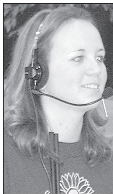
Join me at the Telethon!

Saturday, Feb. 2 1-10 p.m. at The Gateway, Oberlin or on Local Access Channel 7 Making a difference in Decatur County!