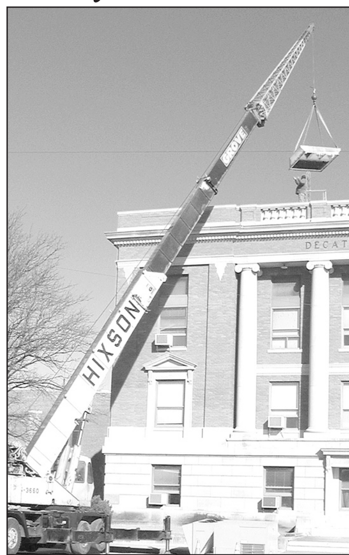
THE COUNTY CLOSED part of Hall Street last Tuesday while a large crane and crew of men put a new heater and air conditioner on the roof of the courthouse