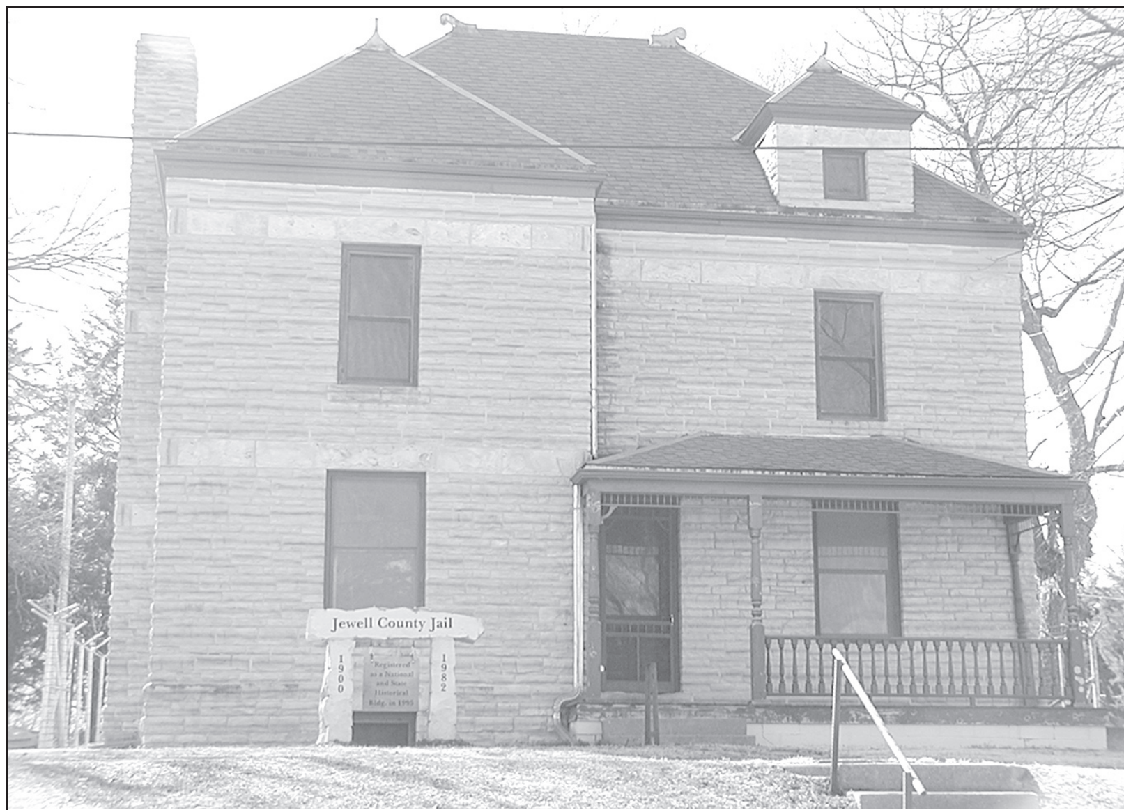
The old stone jail is part of the Jewell County Historical Society Museum. The jail, which is being restored, is on the National Register of Historic Places.