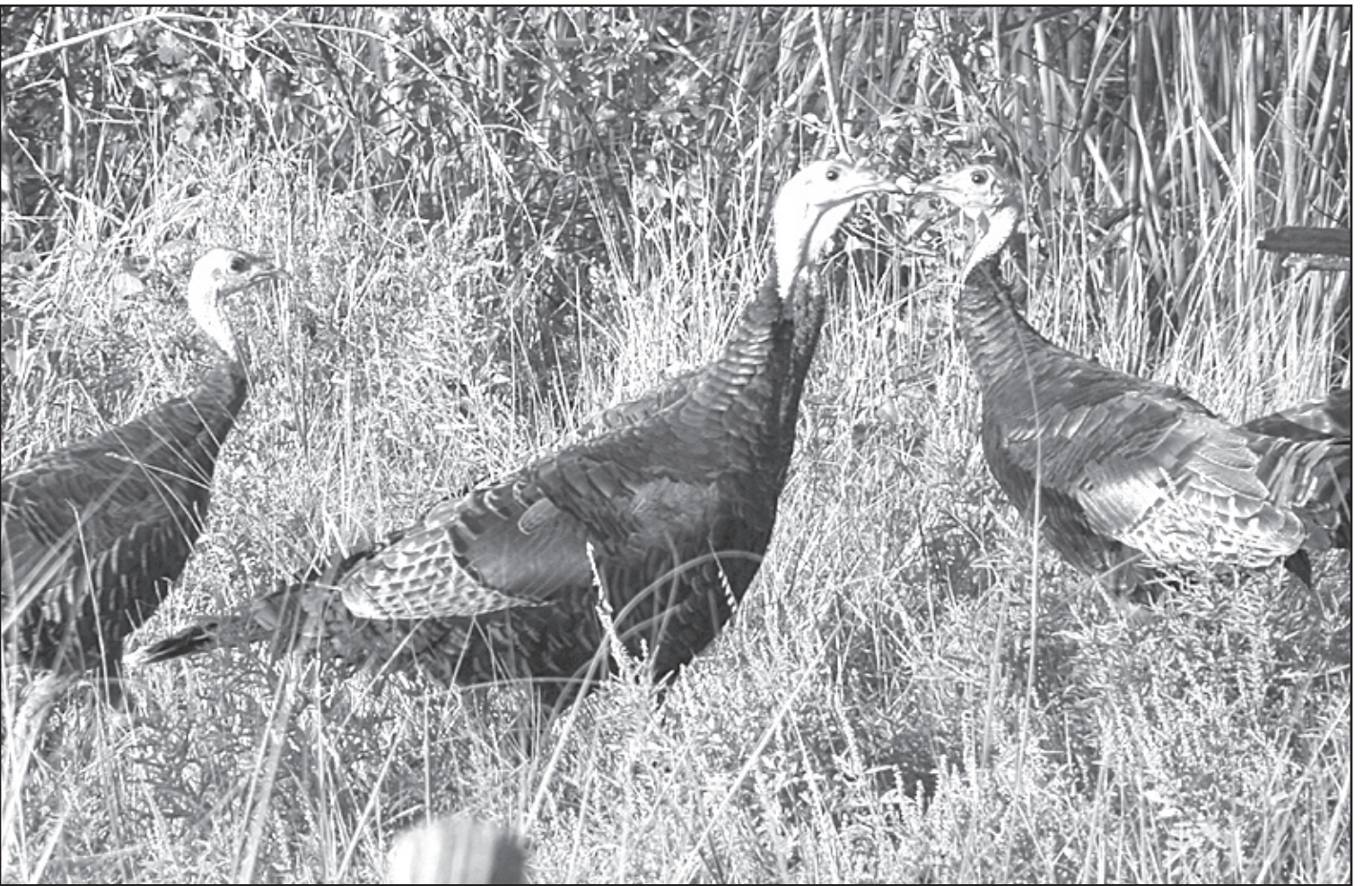
Two wild turkeys in Sherman County check each other out. Turkeys like these were reintroduced into the state in the 1960s.