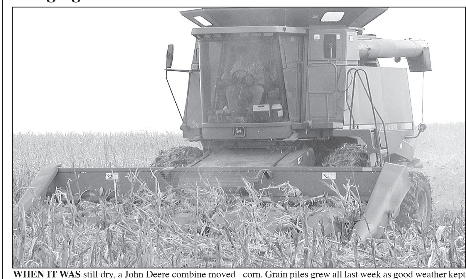
through a field six miles south of town last Tuesday, picking harvesters in the fields.