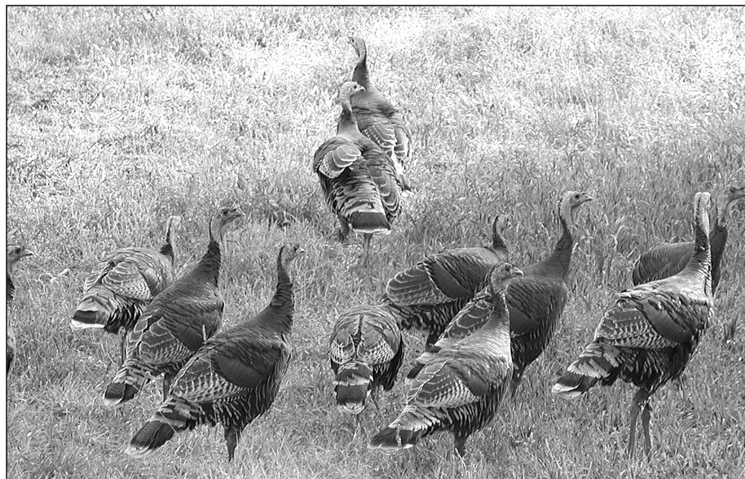
A FLOCK OF TURKEYS walked near the bridge just south of Oberlin last Tuesday. The flock, about 35 in all, had just crossed U.S. 83 heading west along Sappa Creek.