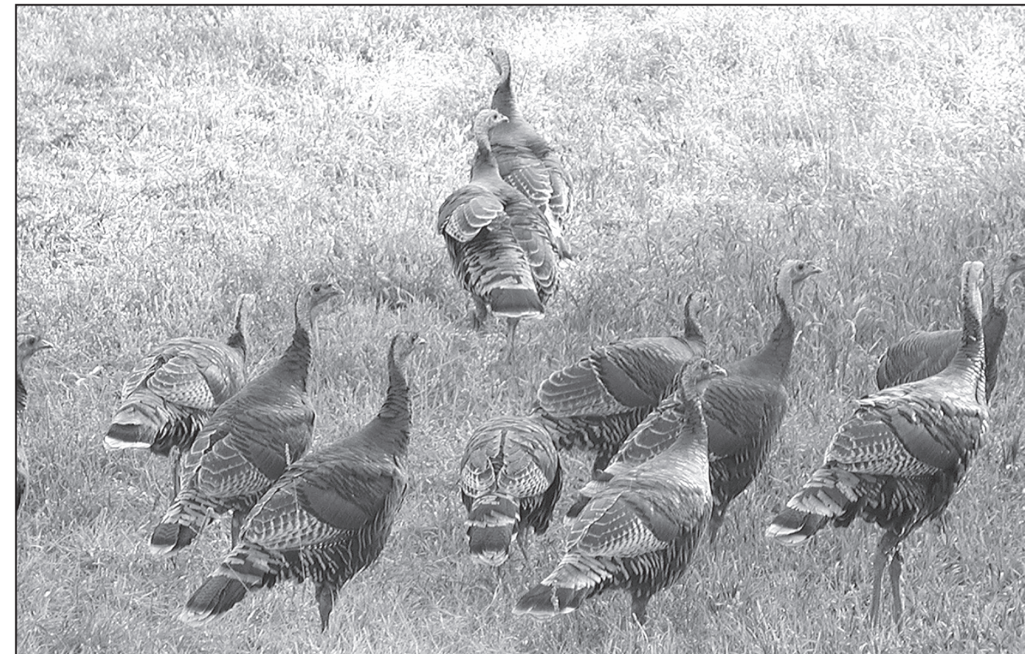
A FLOCK OF TURKEYS walked near the bridge just south of Oberlin last Tuesday. The flock, about 35 in all, had just crossed U.S. 83 heading west along Sappa Creek.