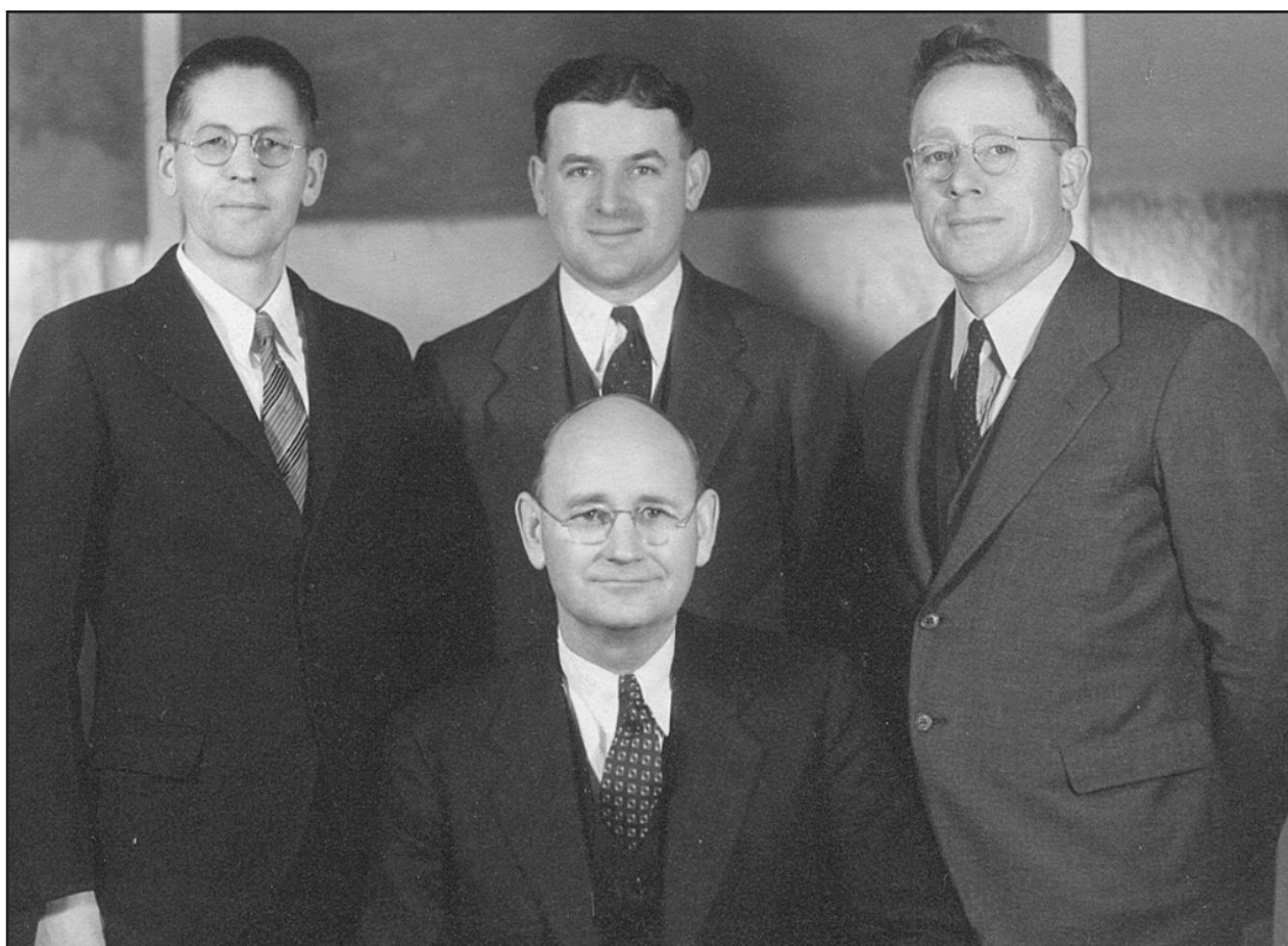
NO. 3 — Is this a board of directors, a covey of lawyers or a very small Rotary Club?