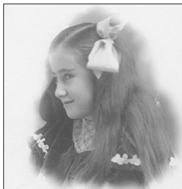
NO. 6 — Name this little girl.