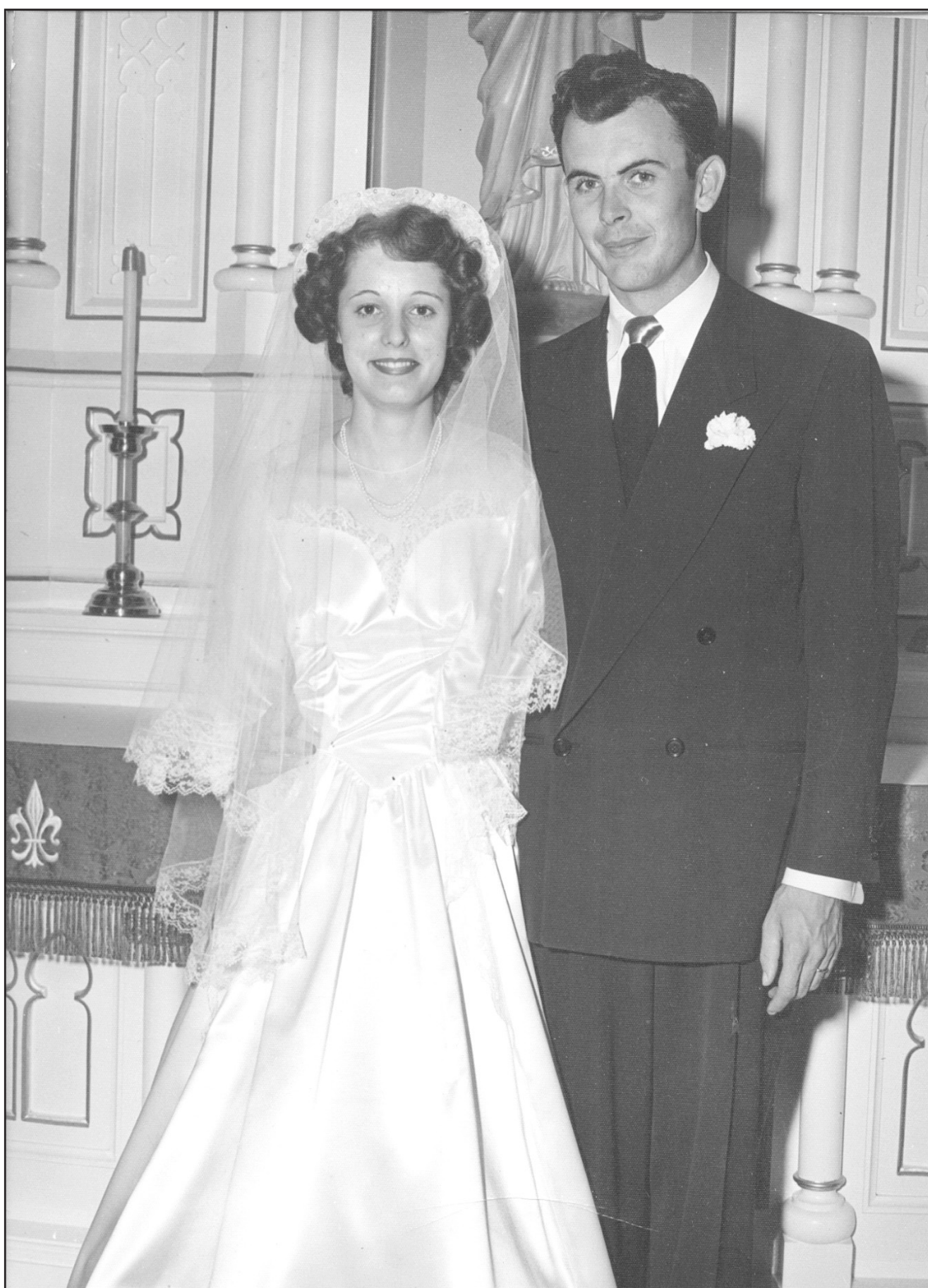
NO. 1 — Who is this happy couple?