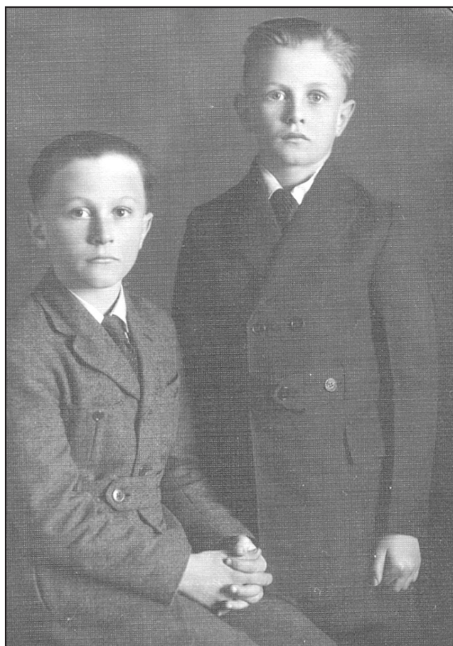
NO. 2 — Name these two well-dressed young men.