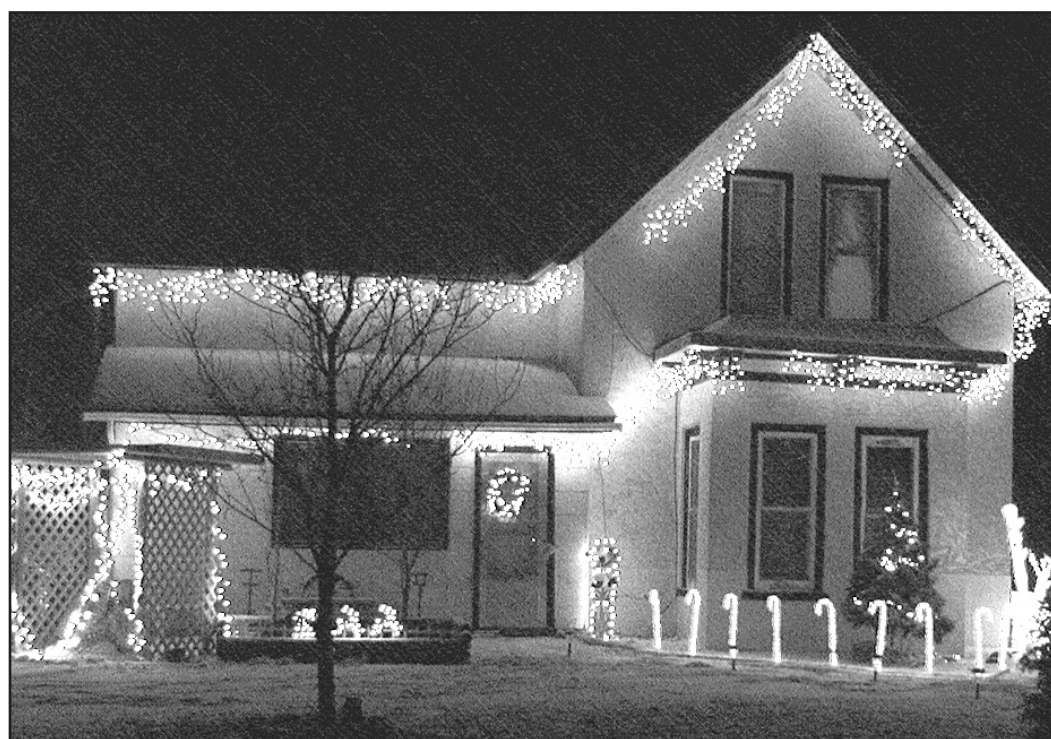
CANDY CANES LINED two sides of the house at 102 S. Cass (above), which also had lights on bushes, trees, the roofline and fences. Across the street at 109 S. Cass, three trees (below) stood sentinel in the side yard while a small tree in a wagon (right) decorated the porch.