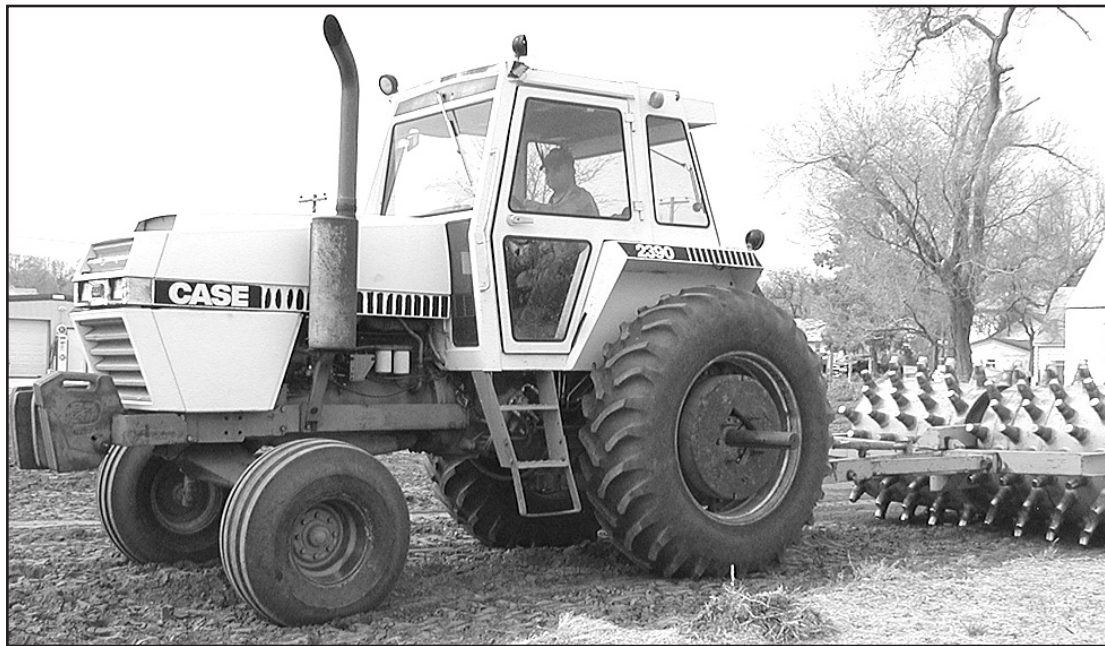
IN A TRACTOR another member of the crew pulled a piece of equipment that packed the dirt down last week.