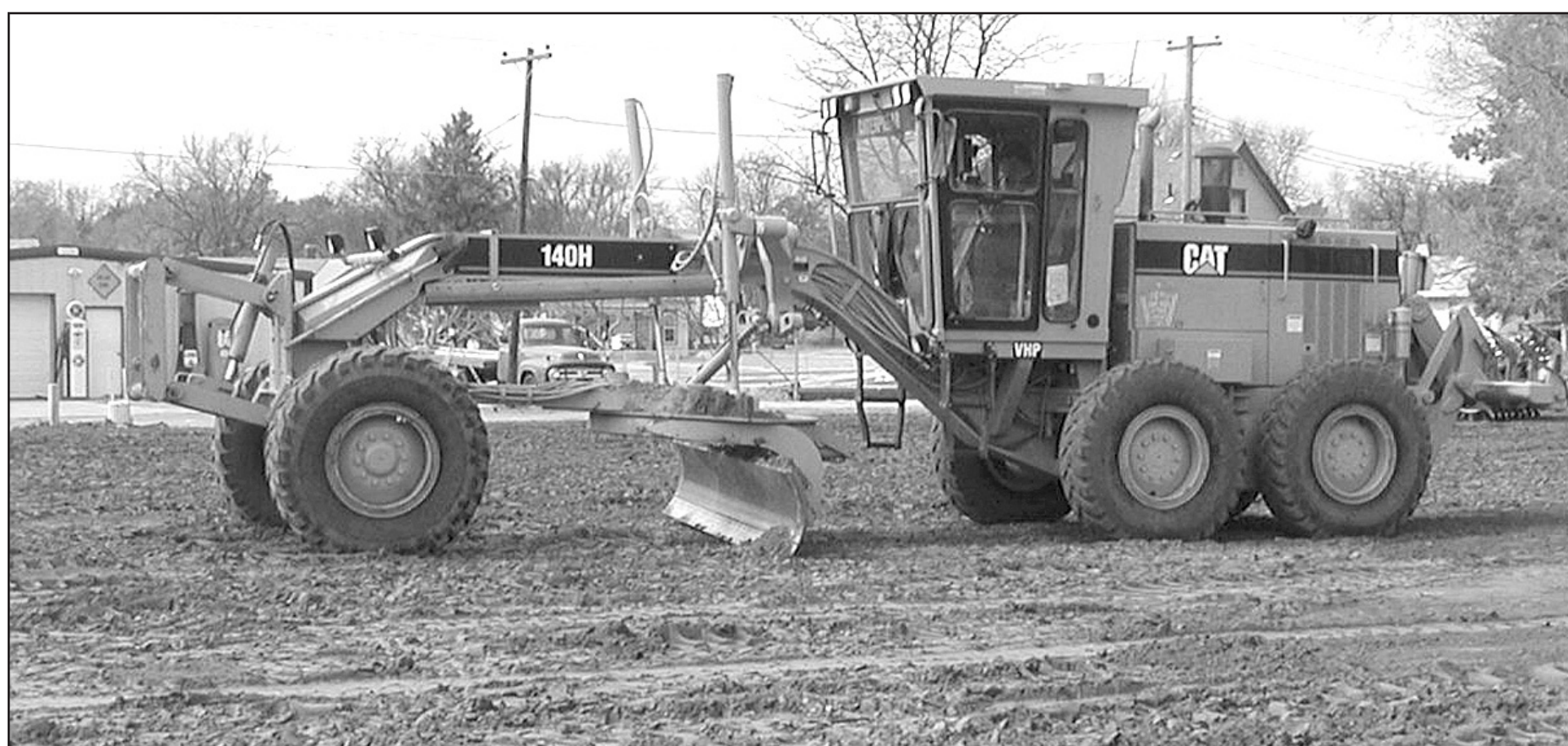
A MEMBER of the Decatur County Road and Bridge crew ran a grader (below) for the inside of the building were handed out at the Oberlin City Council meeting last Thursday. (above) last week to spread out the dirt other members of the crew hauled to the site for the new senior center, theater and bowling alley. The plans