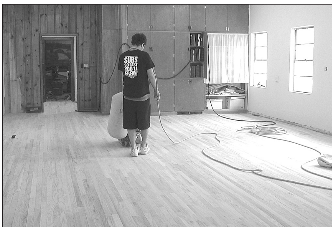
WITH MASKS ON THEIR FACES , men with VonLintel's Refinishing Inc., out of Hays (left and above) worked on the floor in the old section of the museum. The building which used to house the main office will be home to a small parlor which groups can use for meetings.