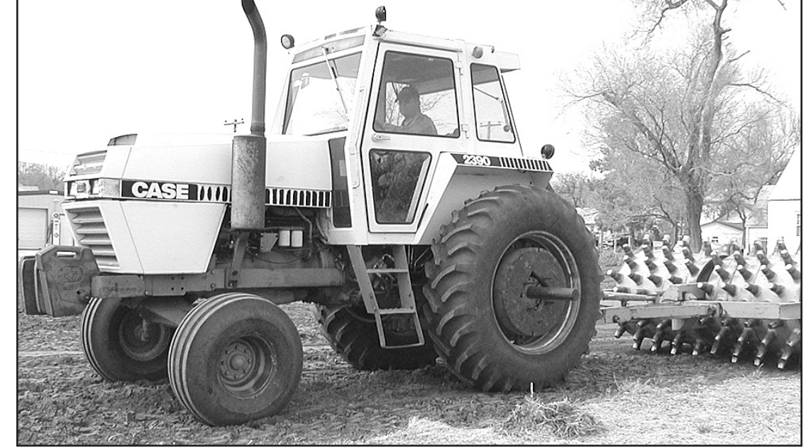
WITHATRACTOR, another member of the crew pulled a sheep's-foot roller that packed the dirt last week.