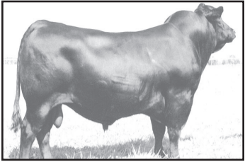
MUSCLE Muscle is a big, deep, wide soggy bull that is very easy keeping. His calves are very small at birth.