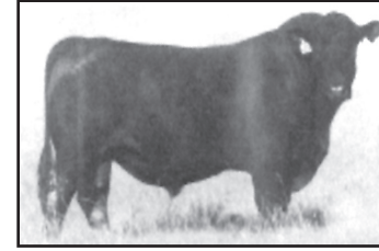
S A V 004 Hold'em 4452 S A V was one of the top selling in the 2005 Schaff Sale. He sires thick, easy doing cattle.

(130) 18 Mo. OLD REGISTERED ANGUS BULLS FOR SALE ON FARM • 40+ EMBRYO BULLS