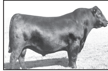
FREY'S 486R Frey's 486R is a bull that covers all the bases. His calves are small at birth that grow quickly.