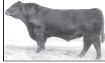
FREYS PROUD DESIGN 410P 410 is a very easy calving bull, with tons of performance. His calves ratioed very high.

LUDELL, KANSAS LOCATION: 13 Miles Northeast of Atwood, Kansas