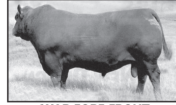
WAR FORE FRONT This Fore Front sons calves are born very easily and grow rapidly with great thickness.