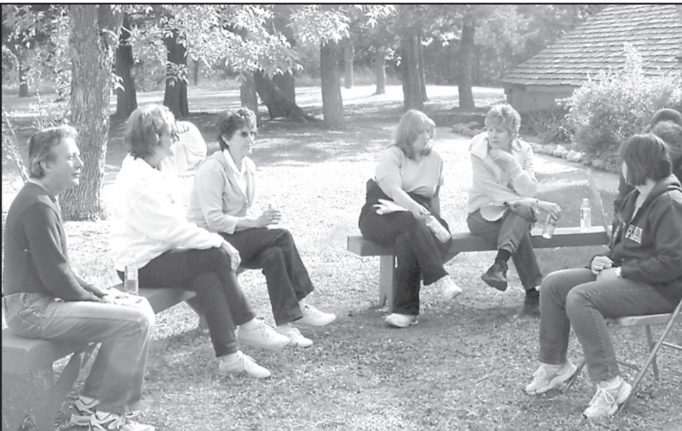
IN FRONT of the shelter house, a group took a break after walking the trails at Sappa Park during a fun walk in May.