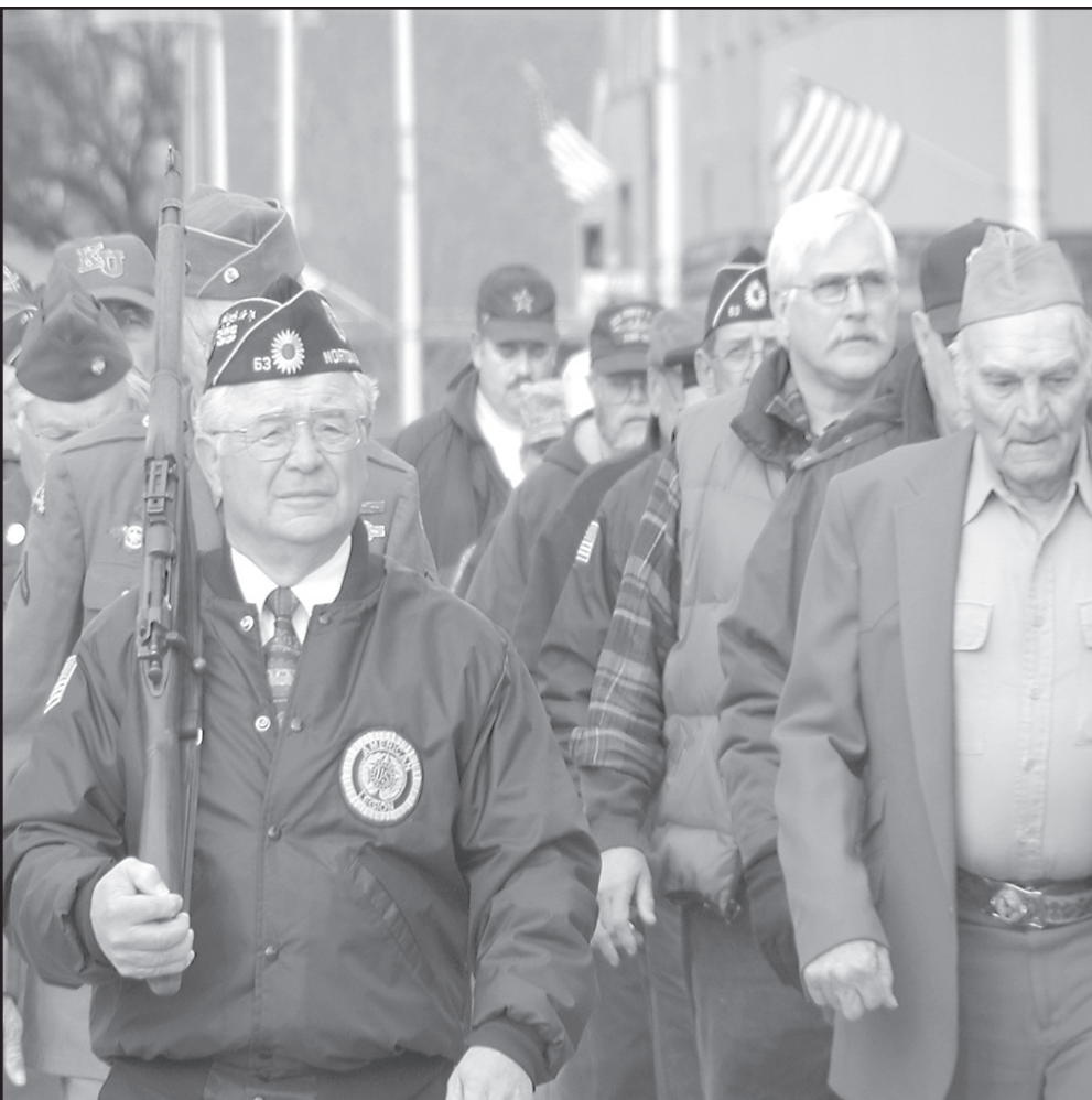
THOSE WHO SERVED are the focus of the annual Norton Veterans Day Parade. Here they are pictured marching down State Street being greeted by hundreds of parade goers.

Whoever said, "There's nothing to do in a small town," obviously never lived in a small town.