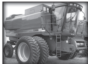
1999 Case-IH 2388 axial-flow combine

AG EQUIPMENT INTERNET ONLY NO RESERVE! Bidding Ends Wednesday, April 22 | 10:00 A.M.