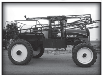
2005 Apache 850 Self propelled sprayer

Complete catalog with detailed photographs, descriptions & seller contact information at purplewave.com 10% buyer's premium applies