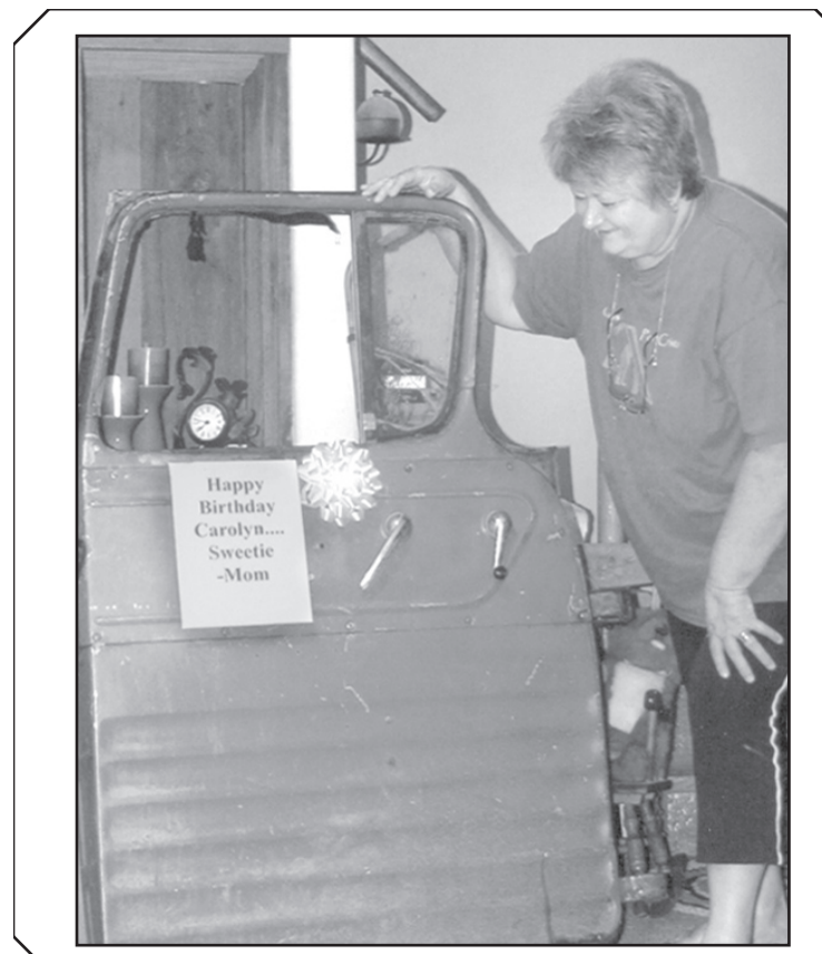
She said she wanted Red Door for her birthday

Sell items fast in the Classifieds 475-2206