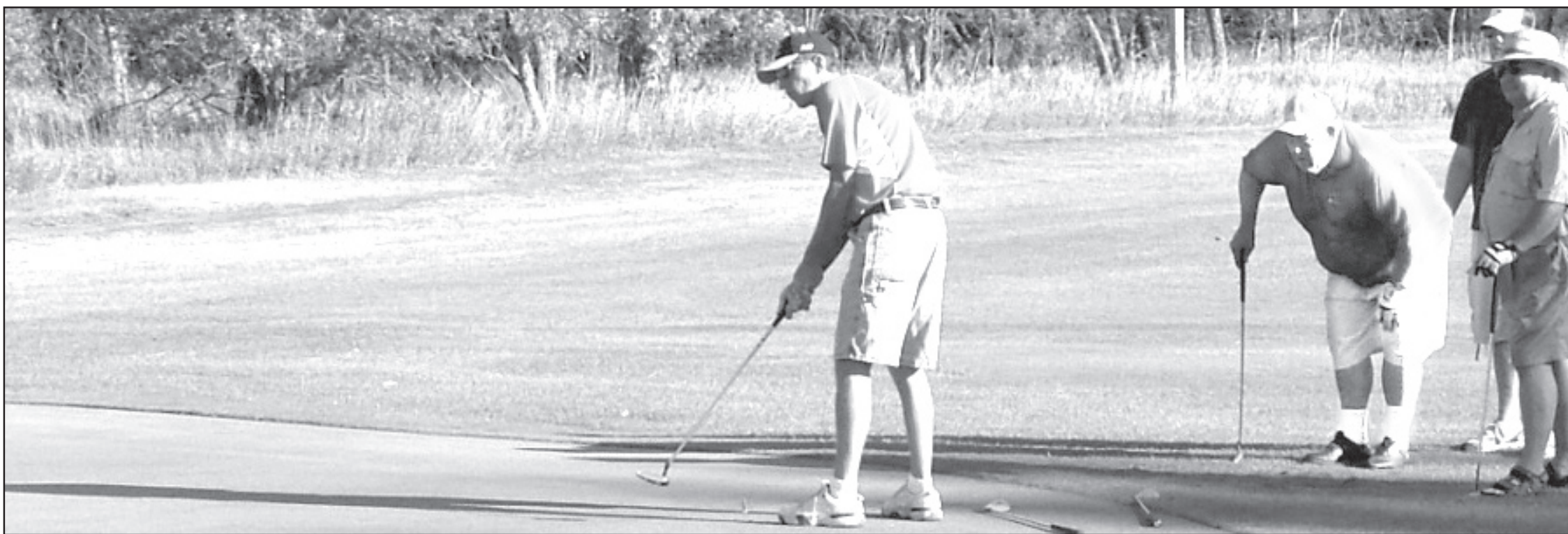
PLAYERS CHECKED OUT A PUTT (above) during the annual Decatur County Health Systems golf tournament on Saturday at the Oberlin Country Club. Afterwards, donated items, including a KU T-shirt and football, were auctioned off after dinner at the American