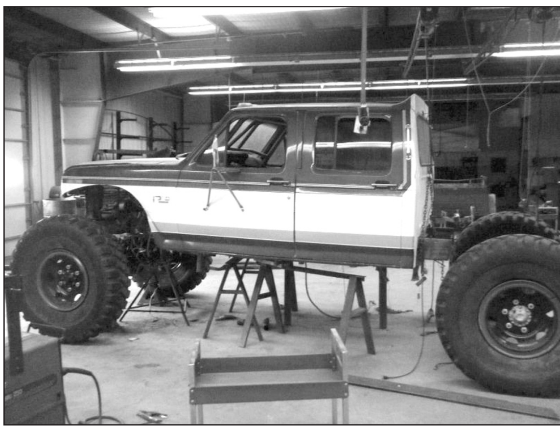
THE AGRICULTURAL MECHANICS CLASS has started to build this rock/mud truck as one of their student shop projects.