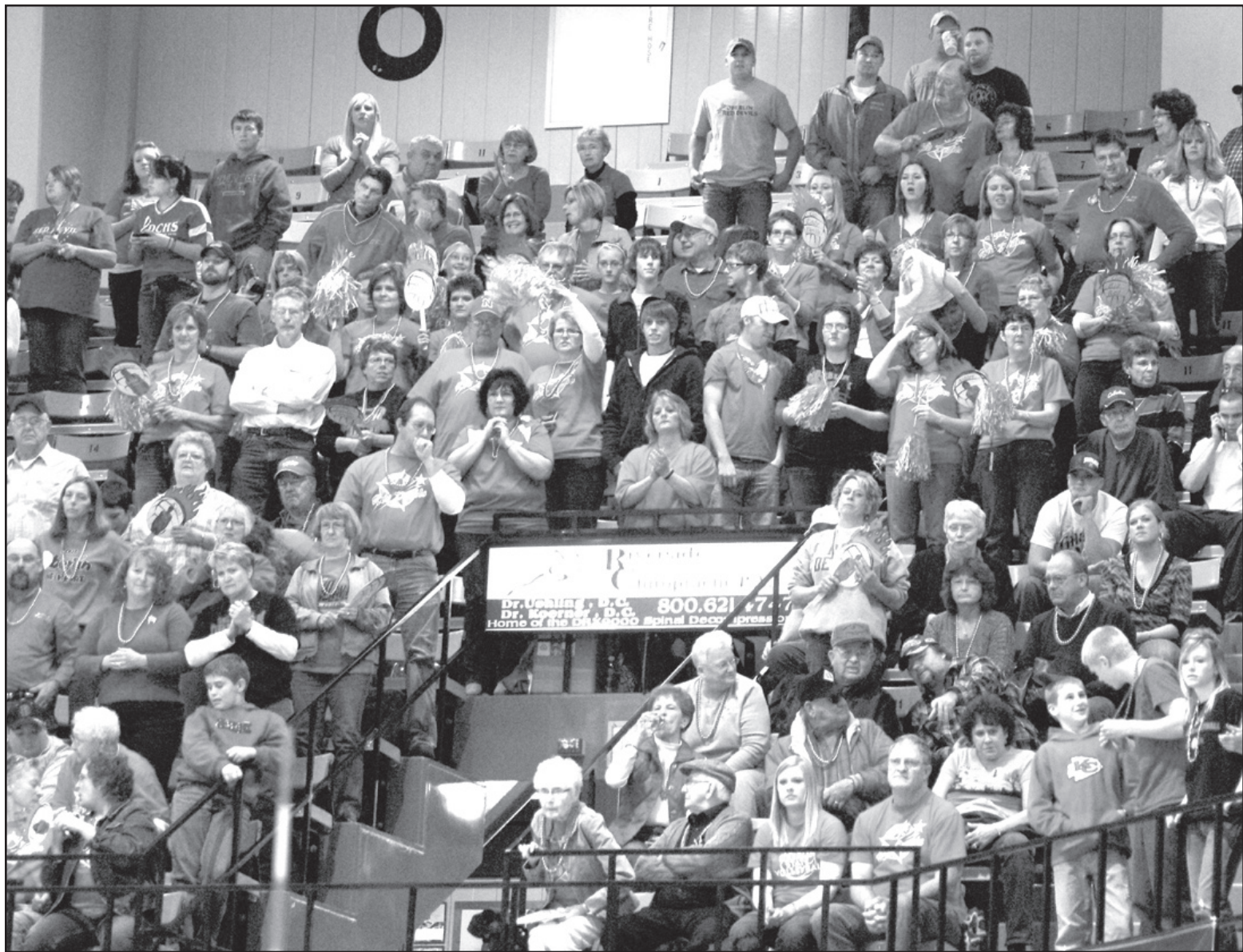
OBERLIN VOLLEYBALL PLAYERS (left) jumped in unison during their first match on Friday against the Sacred Heart Knights. A large crowd of fans (above) followed the girls to Hays to watch them win three in a row in pool play.