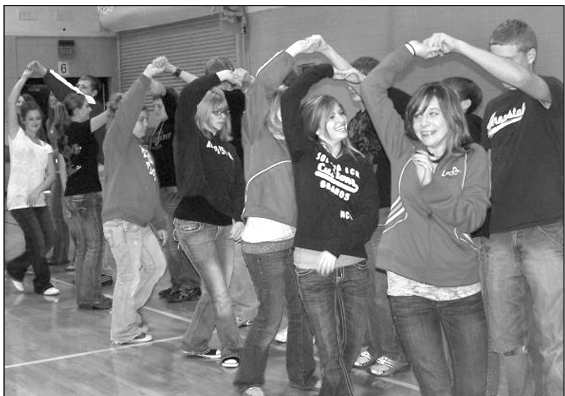
SPANISH CLASSES learn how to Mamba.