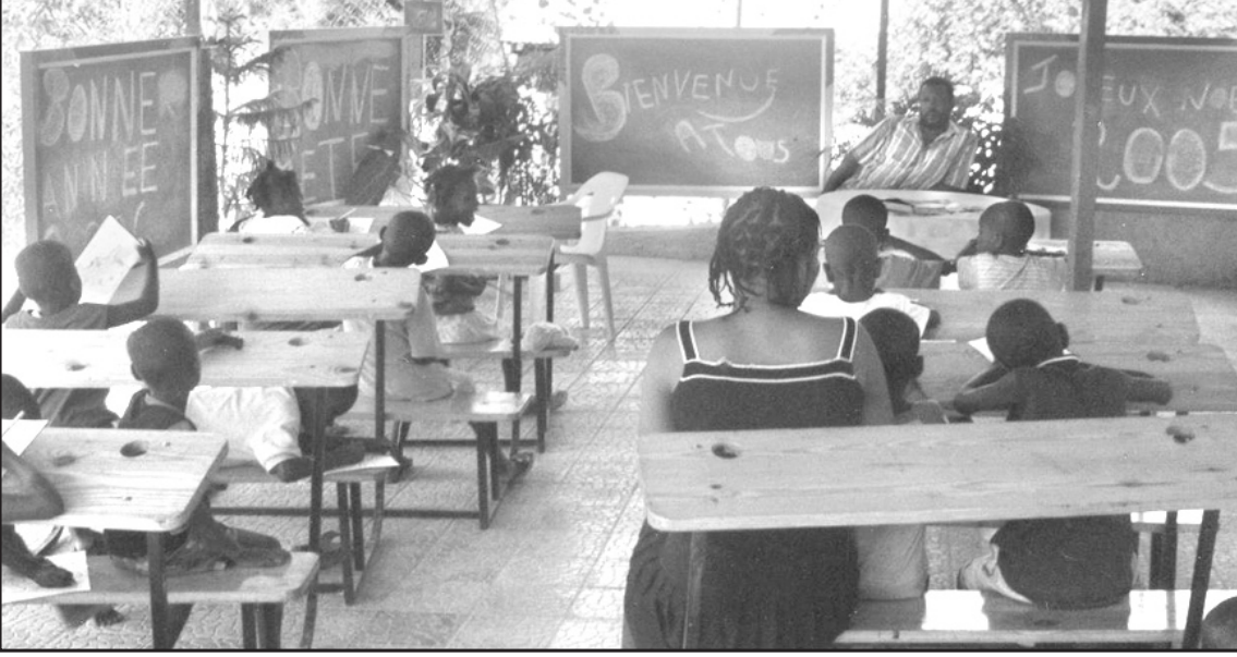
STUDENTS at the House of Hope in Haiti learn at an adjoining school.