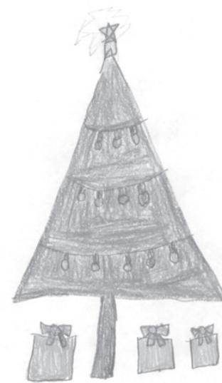
third grade, Golden Plains