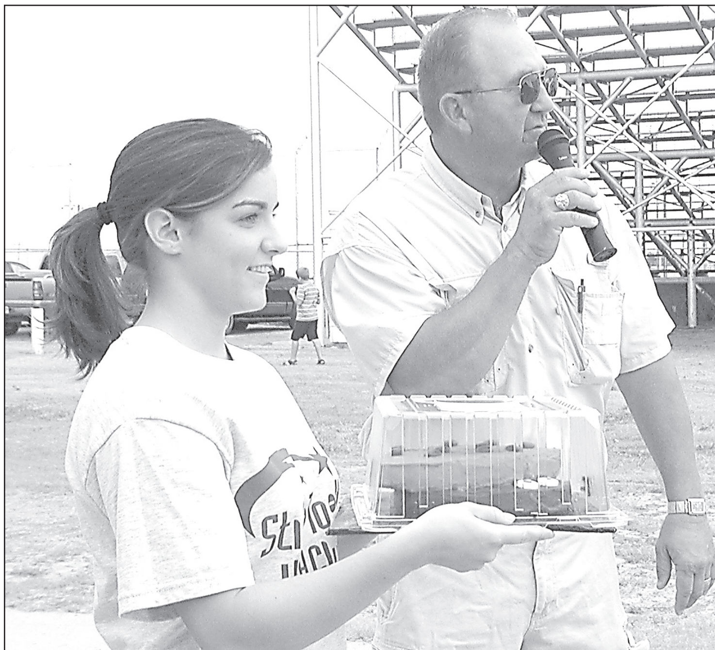
goodies during the Decatur County Food Auction at the fair. including her senior prom in 2006.