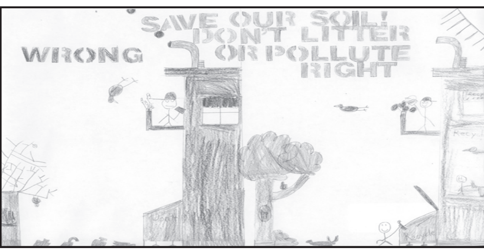
Dayton Kempt, 5th grade, second place