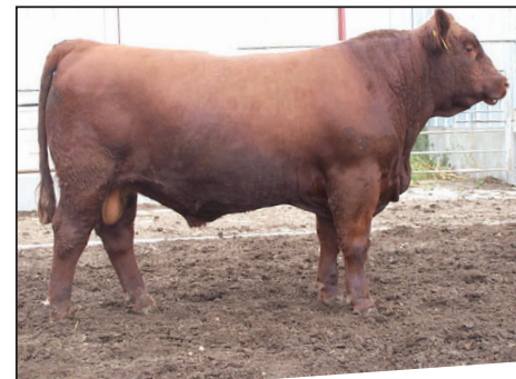
3/4 Red Angus, 1/4 Simmental Sired by Direct Ticket

Our Two-Breed Program provides Yield, Grade and Type so strong, it's hard to identify breeds.