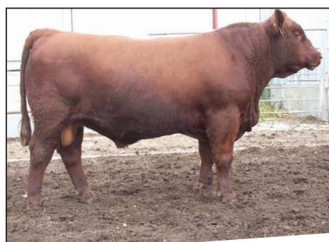
3/4 Red Angus, 1/4 Simmental Sired by Direct Ticket

Our Two-Breed Program provides Yield, Grade and Type so strong, it's hard to identify breeds.