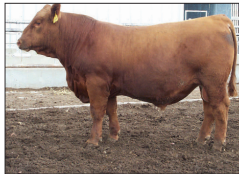
100% Red Angus Sired by Mission Statement

These Bulls are representative of our 2010 offering! All bulls selling are determined to be Osteopetrosis (OS) Free!