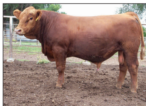
3/4 Simmental, 1/4 Red Angus Sired by Shear Force 38K