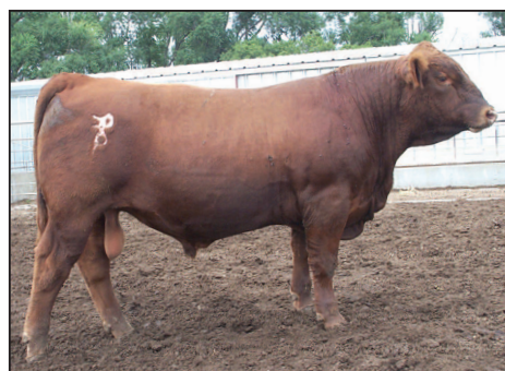
3/4 Red Angus, 1/4 Simmental Sired by Boone 8000