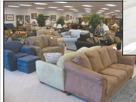
Sofas & Loveseats