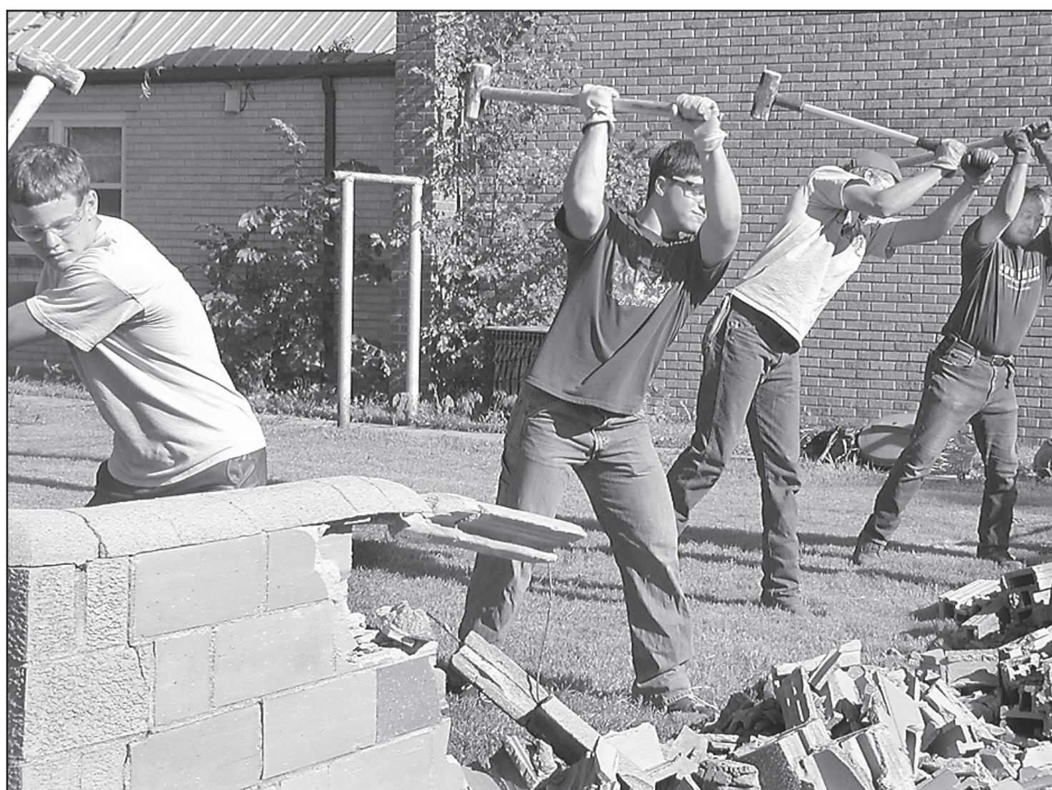
SWINGING THEIR HAMMERS almost in unison, Oberlin United Methodist youth-group members and a leader helped take down a backyard wall at the church's