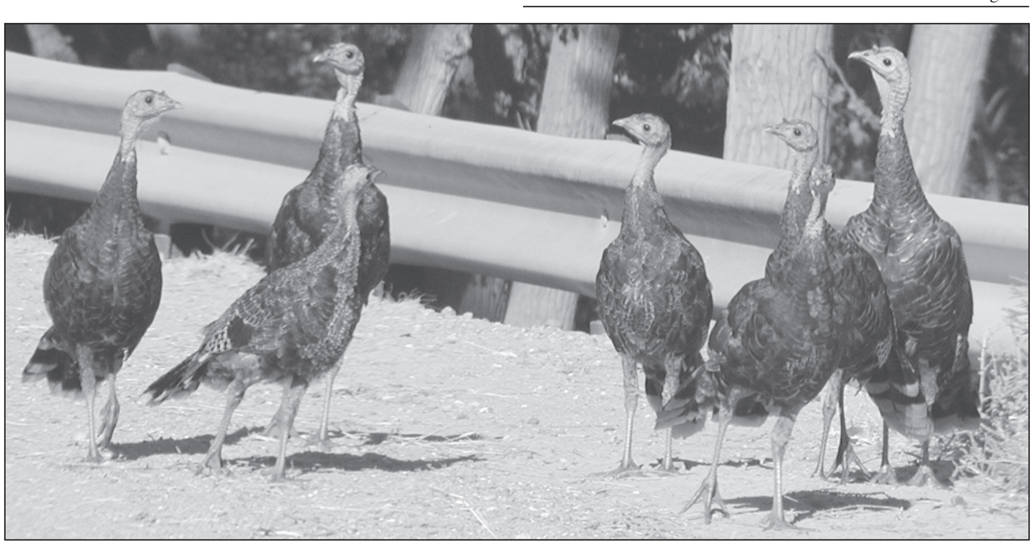
Turkeys roam on the side of U.S. 36 in St. Francis, the county seat of Cheyenne County.