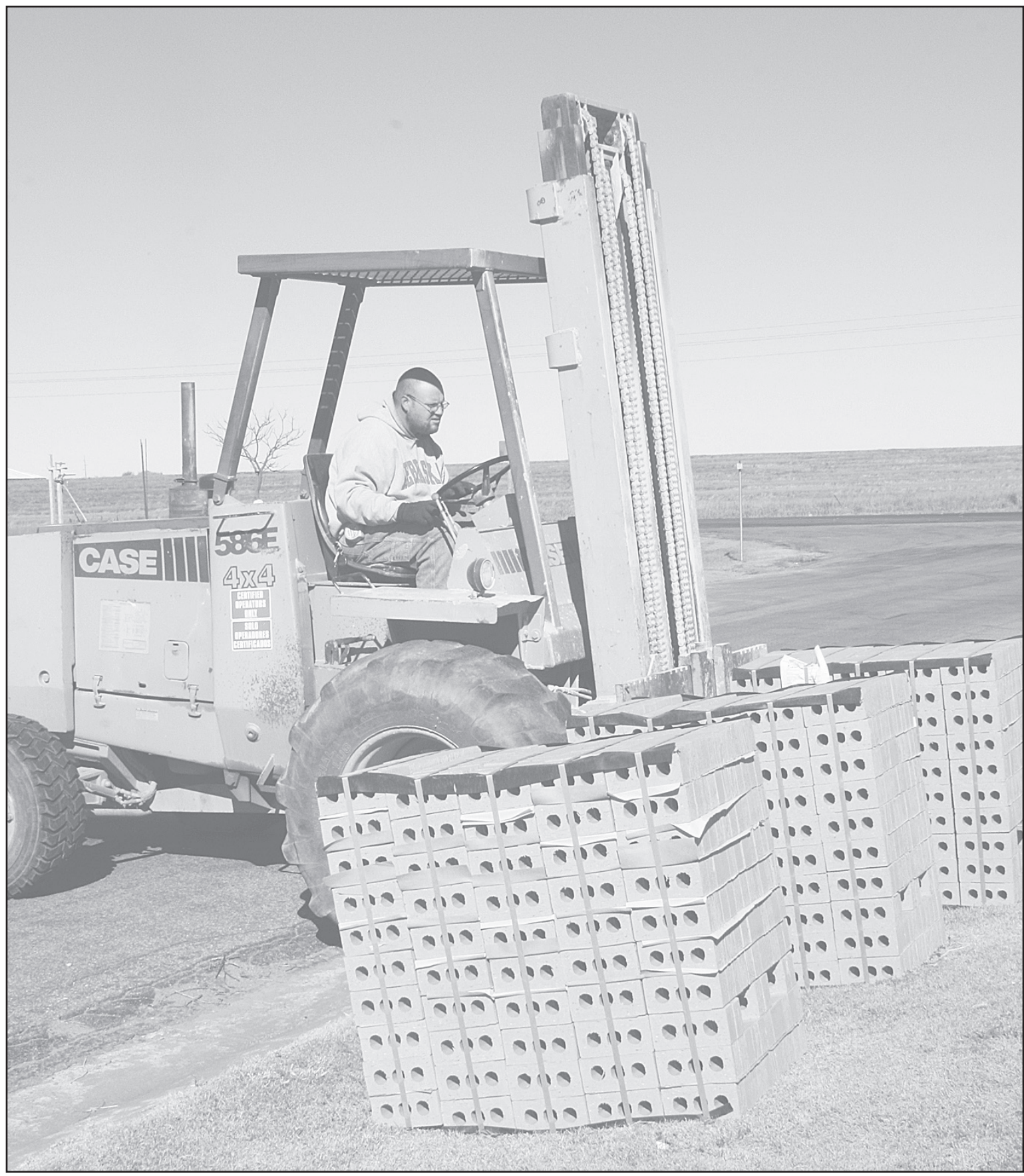
pile of bricks from the east side of the street to the west side for property, along U.S. 36. the wall around the new section of the cemetery. Al Schwarz