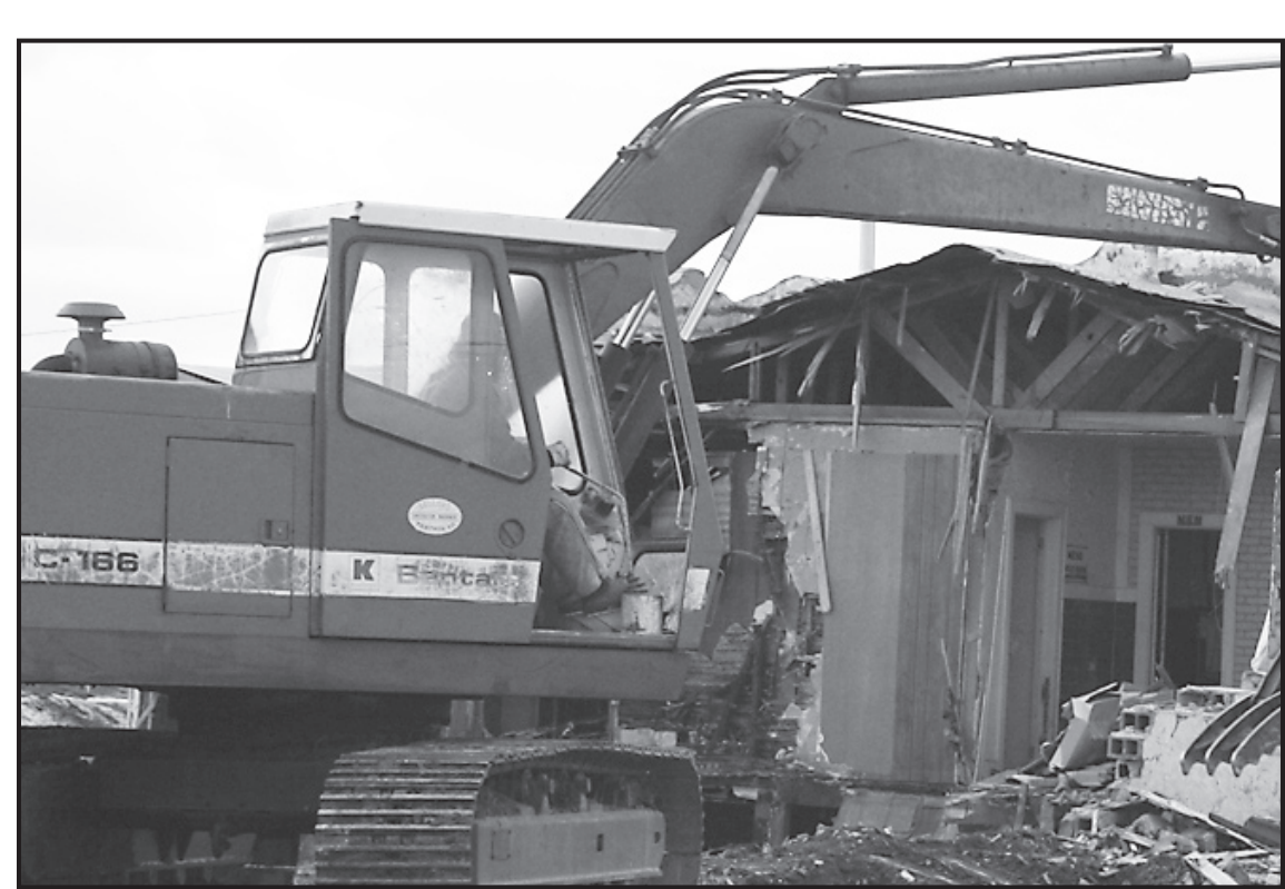
AN OBERLIN LANDMARK, located on U.S. Highway 36, was demolished by crews on Monday. It is on the property of the Oberlin Inn and had been used in the past as a cafe and service station and later a liquor store.

Approved a standard lease for anyone wanting to rent land at the airport, including for the hangars. It's good to have something consistent, something clear and with