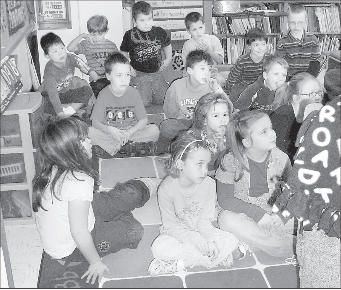
OBERLIN ELEMENTARY SCHOOL first graders relax on the new reading rugs which were given to them from the Decatur Community Educational Foundation.