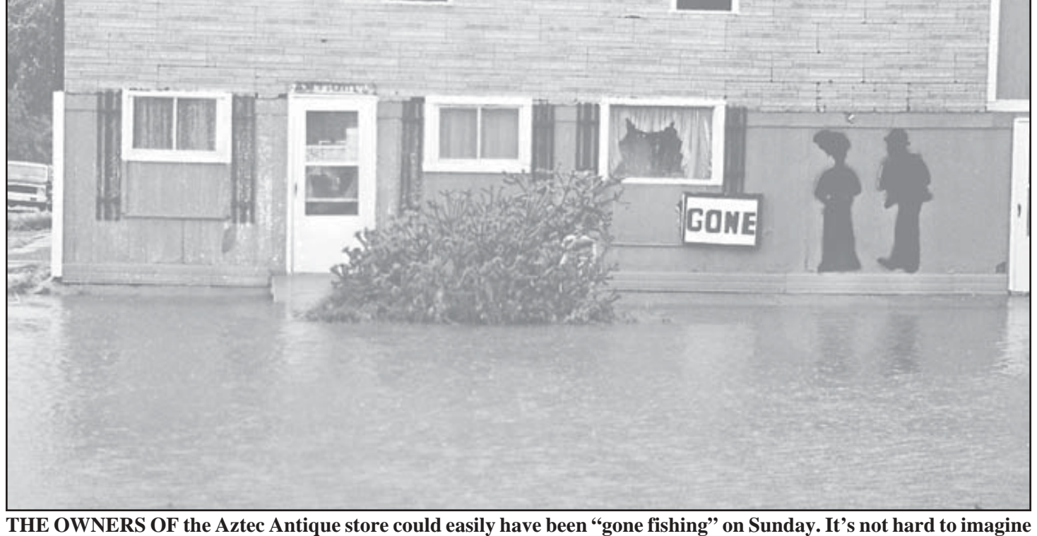
that with this much water there had to be a whopper or two swimming around.

"I love those who love me, and those who seek me diligently will find me" (Proverbs 8:17) written June 2, 2003