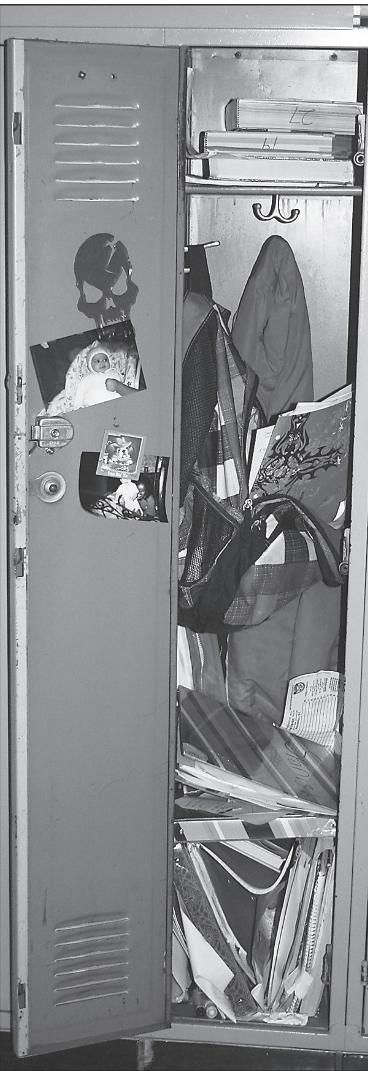
STUDENTS AT DECATUR COMMUNITY HIGH still use the lockers their grandparents used. This is an example of how a large percentage of the students “maintain” their lockers.