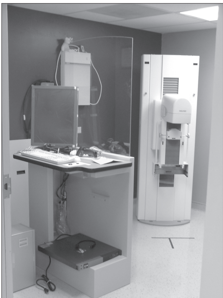
Digital Mammogram Machine Make an appointment now! call 785-475-2208